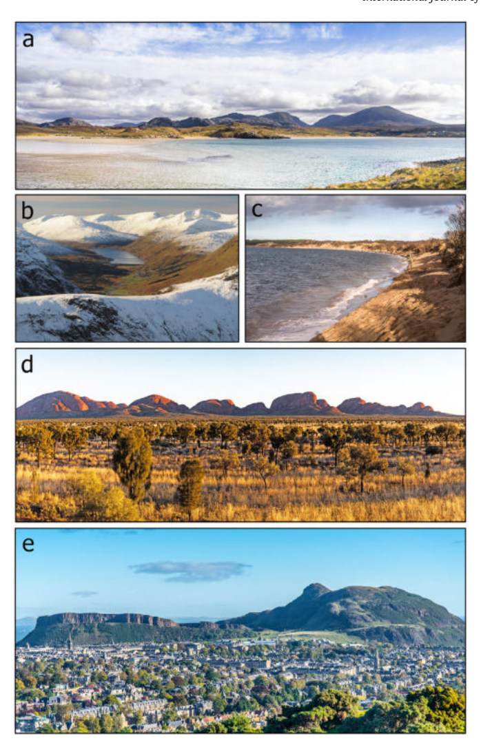
Fig. 1. Examples of the values and benefits of geodiversity and geoheritage. a. The islands of the Outer Hebrides, Scotland, comprise some of the oldest rocks in Europe, Archaean gneisses dating from ~3000 Ma. These rocks were heavily scoured by glaciers during the Pleistocene. They form a landscape mosaic of low, rocky hills and hollows, bordered by dynamic coastal systems, including tidal sandflats and sand dunes. This geodiversity supports a corresponding range of habitats, from acid peatlands and species-poor wet heath to calcareous coastal grassland and intertidal marine habitats. b. Glacially deepened valleys in the Highlands of Scotland provide locations for reservoirs for public water supply and hydro-electric power generation, but associated dams interrupt natural river flow regimes. c. Beaches, sand dunes and saltmarshes act as natural buffers and help to mitigate coastal erosion where there is space inland to allow natural coastal realignment. d. The inselberg massif of Kata Tjuta forms part of the Uluru-Kata Tjuta National Park, Australia, a World Heritage site listed for natural and cultural reasons. The site is important for geoheritage, cultural heritage, wildlife habitats, recreation and geotourism. e. Geoheritage is a feature of many urban environments. The remnants of Carboniferous volcanoes provide a dramatic backdrop to the city of Edinburgh, Scotland, while many of the buildings of the Old Town, a cultural World Heritage Site, are built of local Carboniferous sandstones. (Photos © John Gordon).

This is not sufficiently clearly defined and is necessarily restrictive. Work is therefore underway, led by IUCN, to provide improved definition of the criteria. Also, despite expert reviews (e.g. Dingwall, Weighell, & Badman, 2005; Goudie & Seely, 2011), the site coverage of the range of geological and geomorphological features is not comprehensive or systematic. Recent reviews have underlined this lack of adequate coverage for volcanic features (Casadevall, Tormey, & Roberts, 2019) and granite landscapes (Migoń, 2018, 2021). One of the reasons is that the international expert community has not been perhaps sufficiently influential with host governments in persuading them to develop the detailed cases for submission to the World Heritage Committee, and another is that the latter may see greater value in the recognition of cultural heritage sites, which substantially outnumber the natural sites. The approval of the Global Geoparks Programme by UNESCO in 2015 has resulted in it playing an increasingly important role in geoconservation nationally and globally. However, UNESCO Global Geoparks serve a broader purpose, including to develop sustainable tourism based on geoheritage, and are primarily community driven (UNESCO, 2016).