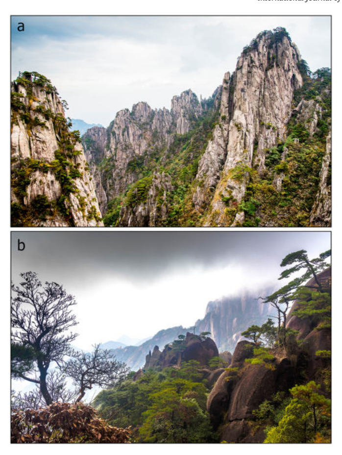
Fig. 2. a. Huangshan UNESCO Global Geopark, Anhui Province, China, is also a natural and cultural UNESCO World Heritage Site and a UNESCO Biosphere Reserve. It is one of the most popular scenic areas in China, exceptional for its granite peaks and spectacular rock formations, and widely celebrated in art and literature and for its spiritual connections, rich flora and important habitats. Rock pillars, formed by weathering and erosion exploiting near-vertical jointing in the granite, are imaginatively interpreted as 'Eighteen arhats worshipping the South Sea'. b. Sanqingshan UNESCO Global Geopark and natural World Heritage site, Jiangxi Province, China, is noted for its granite pillars and peaks, forested slopes and aesthetic and atmospheric qualities that attract high visitor numbers. It supports a rich biodiversity and contains notable Taoist associations and cultural relics. Visitor access is facilitated by extensive 'skywalk' routeways with interpretation of distinctive rock features. Both geoparks are supported by geological museums which recognise the links between geoheritage, biodiversity and cultural heritage.

Many of these wider values map directly across to the UN Sustainable Development Goals (SDGs). Geoscience has a role in delivering all 17 of the SDG targets (Gill, 2017). For example, soil conservation is central to sustainable development and food security (SDG2); natural features provide spaces for recreation opportunities to support healthy lives (SDG3); groundwater resources deliver clean water (SDG6); geotourism supports sustainable economic growth (SDG8); and conserving nature's stage contributes to conservation and wise use of oceans (SDG14) and terrestrial ecosystems (SDG15), and hence to the delivery of the Convention on Biological Diversity's Aichi Targets 11, 14 and 15. Geoparks can be potential role models for delivering the SDGs and in particular sustainable benefits for local communities (Catana & Brilha, 2020; Henriques & Brilha, 2017; UNESCO, 2017). Geoscience knowledge is also fundamental to the Sendai Framework for Disaster Risk Reduction in terms of understanding risk from natural hazards and informing resilience, recovery, rehabilitation and reconstruction (Gill et al., 2021). Similarly, many of these ecosystem values are embedded in China's strategy for Ecological Conservation Redlines (Gao, Wang, Zou, et al., 2020).