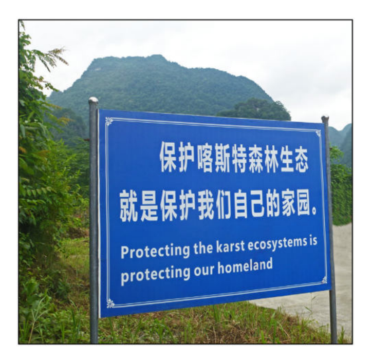
Fig. 4. Noticeboard at Huanjiang Karst, part of the South China Karst World Heritage Site, Guangxi Province. The message encourages local people and visitors to take pride in protecting the karst landscape and the pristine, subtropical, mixed-forest ecosystem with its numerous endemic plant and animal species. (Photo © Murray Gray).

valuable educational resources for fieldwork and learning about geology through a wide range of activities (e.g. Henriques, Tomaz, & Sá, 2012; Han, Wu, Tian, & Li, 2018; Silva & Sá, 2018; Fernández Álvarez, 2020; Catana & Brilha, 2020; Gomes, Castro, Ferenandes, & Loureiro, 2020). Geoparks are particularly well-suited to developing experiential, enquiry-led and place-based learning approaches in geoscience and personally meaningful appreciation of geoheritage through links to cultural heritage and landscape aesthetics (Gordon, 2018b). The educational role of geoparks also includes raising awareness of the wider values of geodiversity and geoheritage, including the interdependencies of geodiversity, geoheritage, biodiversity and cultural heritage